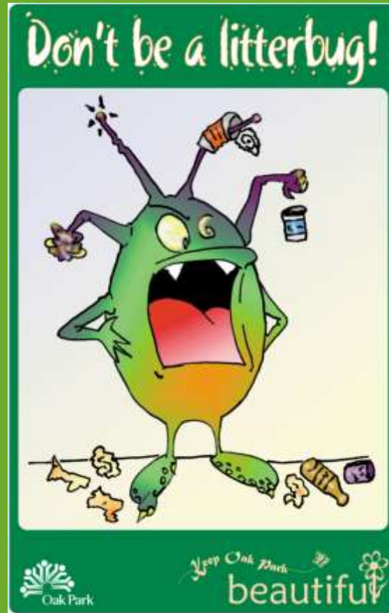
KOPB Partners, Adopt A Block, Alley Clean Up