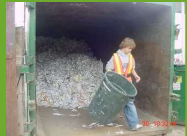
Shredded paper recycling