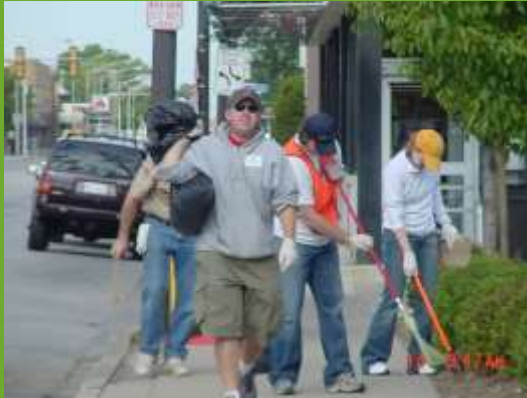
Litter Clean Up