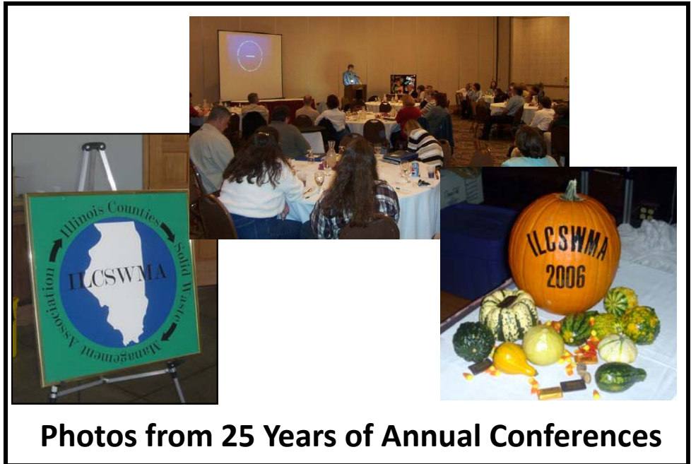
Photos from 25 Years of Annual Conferences